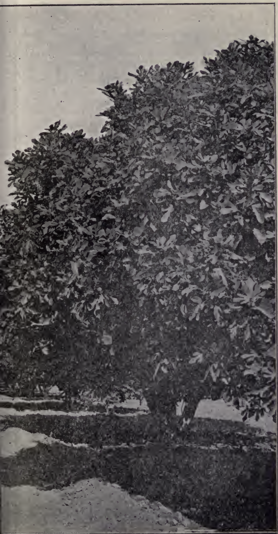
of Fresno County, California