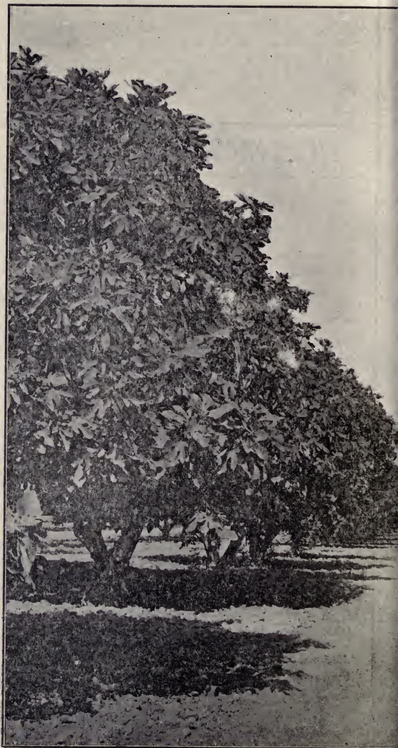
One of the Wonder Fig Gardens