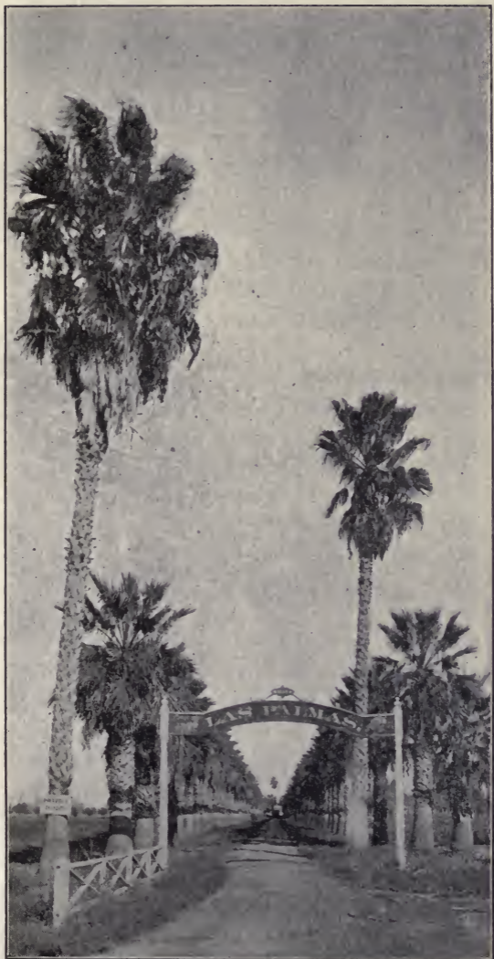
Fresno County, California, Palms